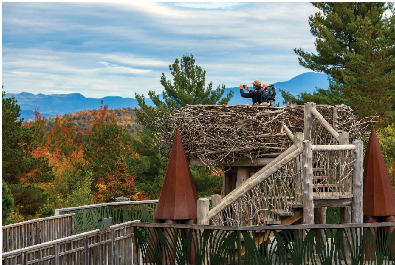
Wild Center Tupper Lake