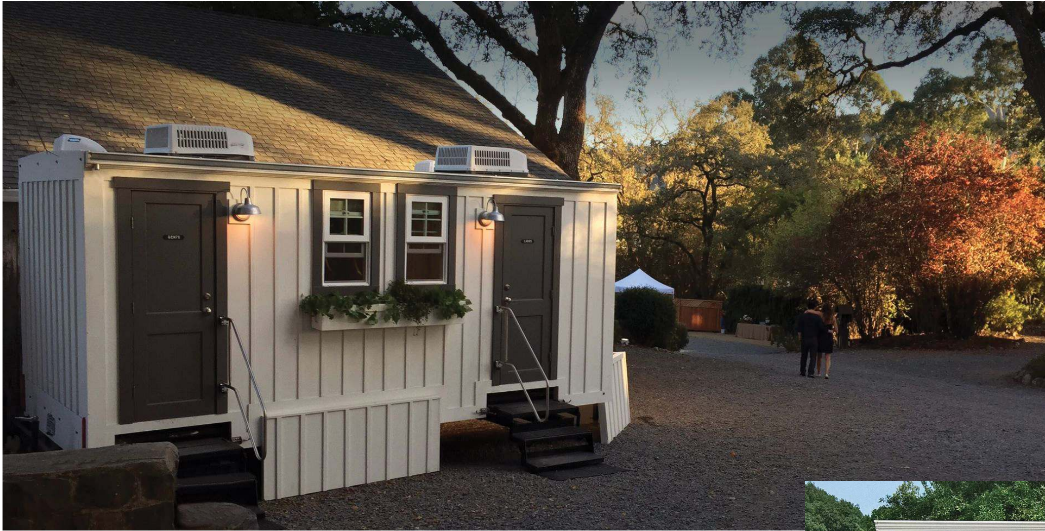
The Water Cottage Potable Toilets