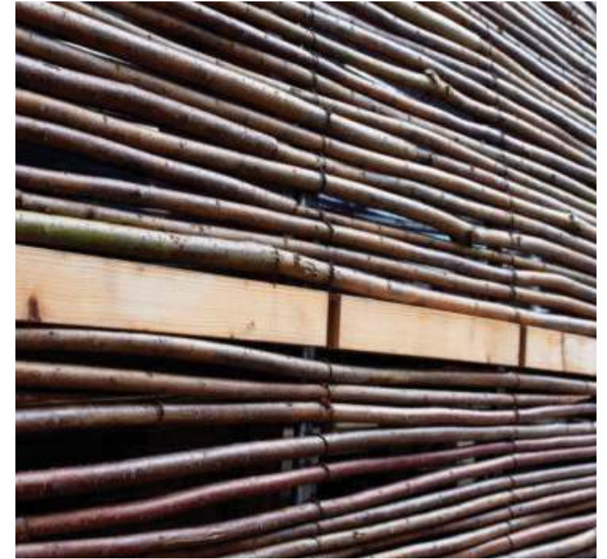
Willow and Recycled Material Pavilion