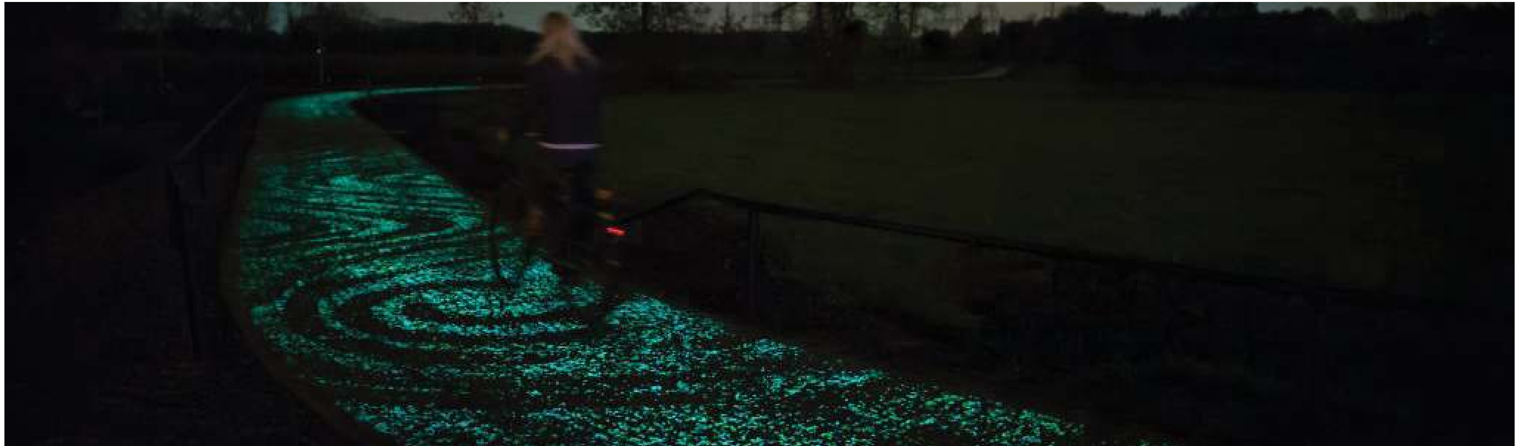
Bike Lane Glowing Asphalt Path