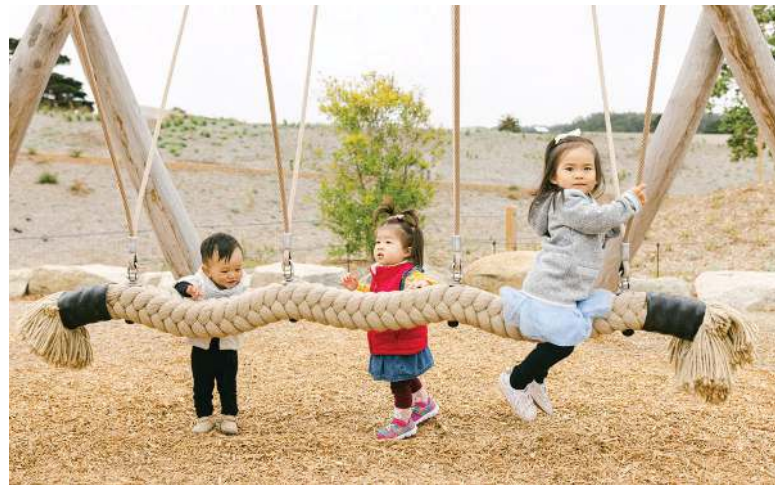
Tunnel Tops at the Presidio San Francisco