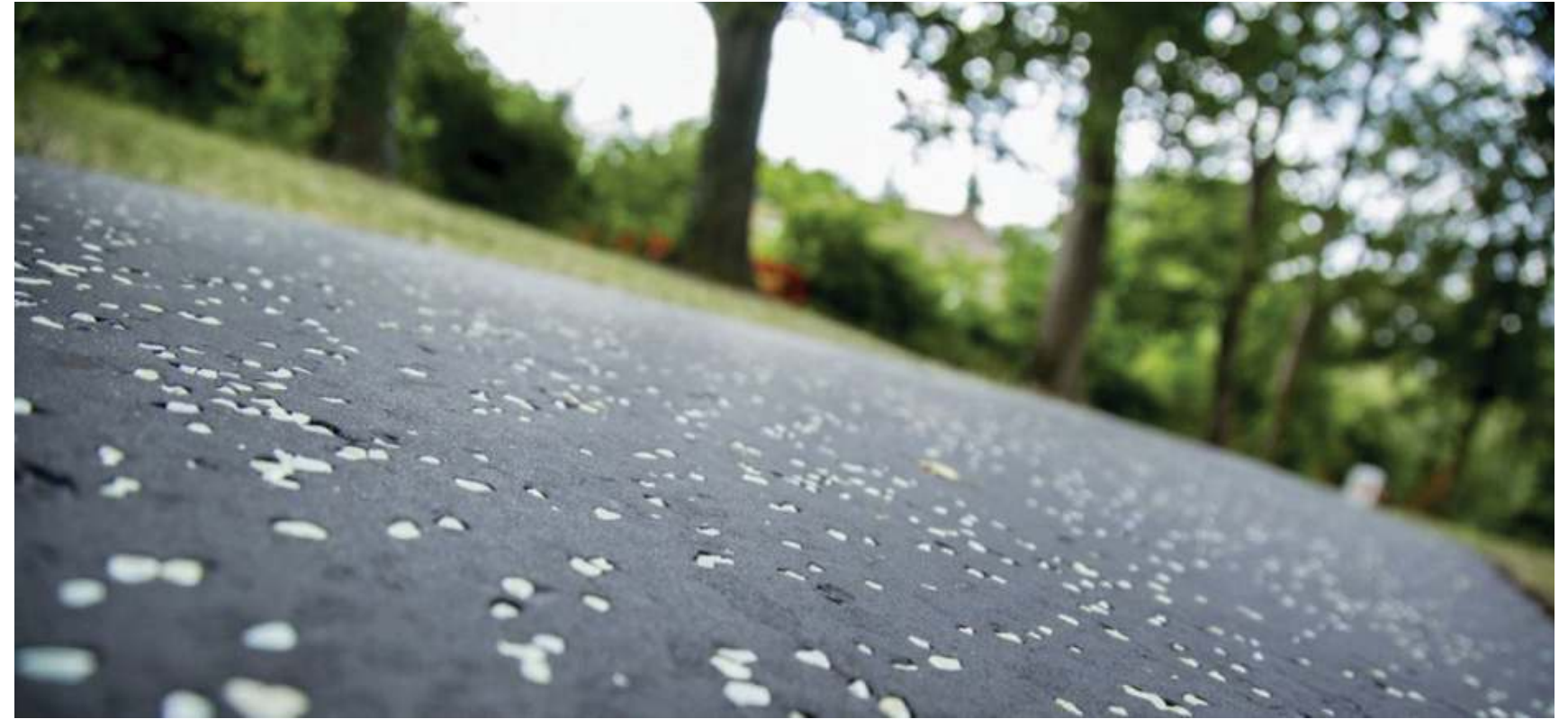
Glowing Asphalt Path During Daytime