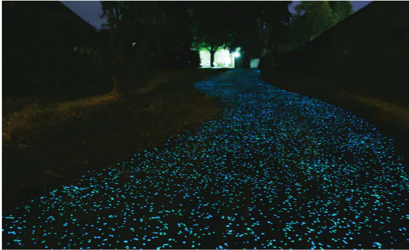
Pedestrian Glowing Asphalt Path