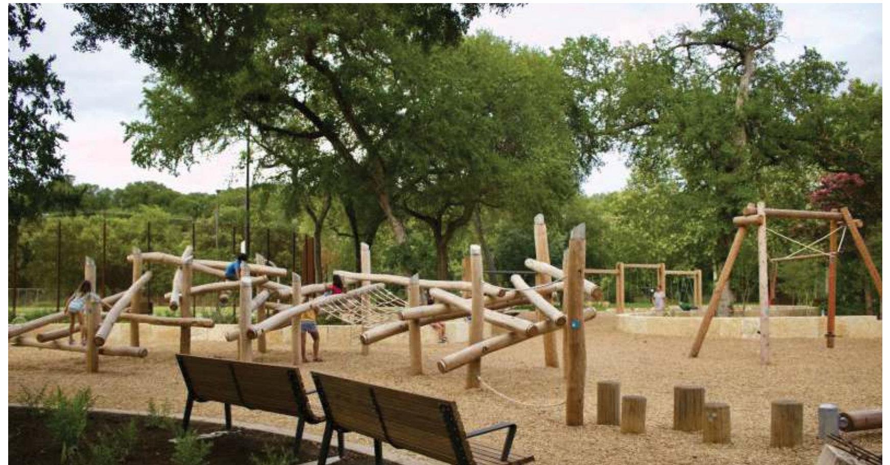
Log and Mulch Playground Materials