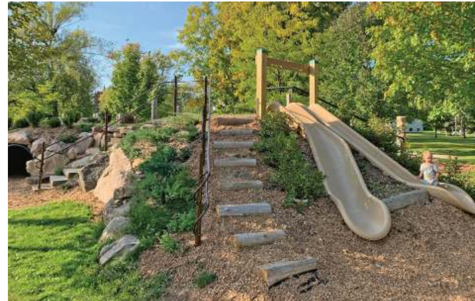
Ives Park Playground, Pottsdam