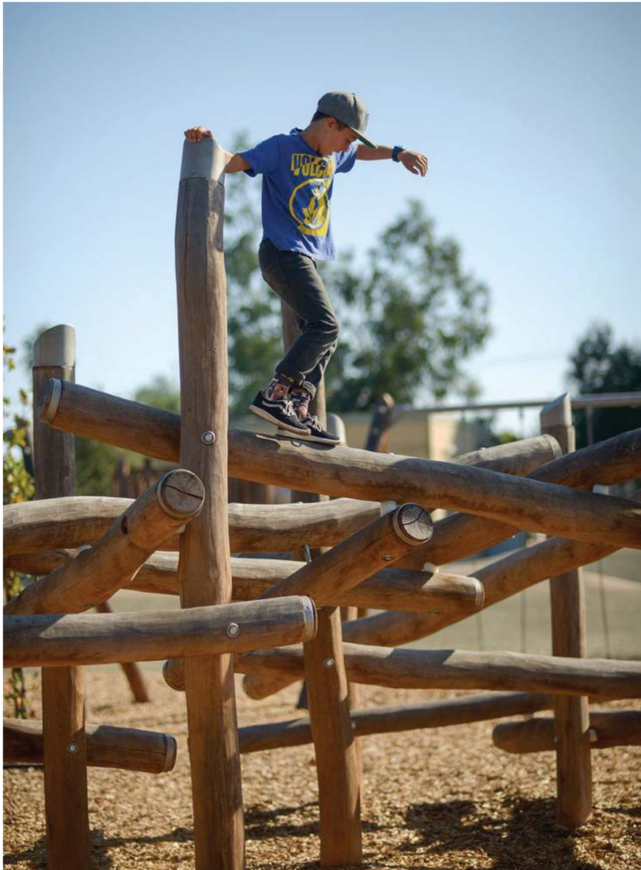
Log Play Structure