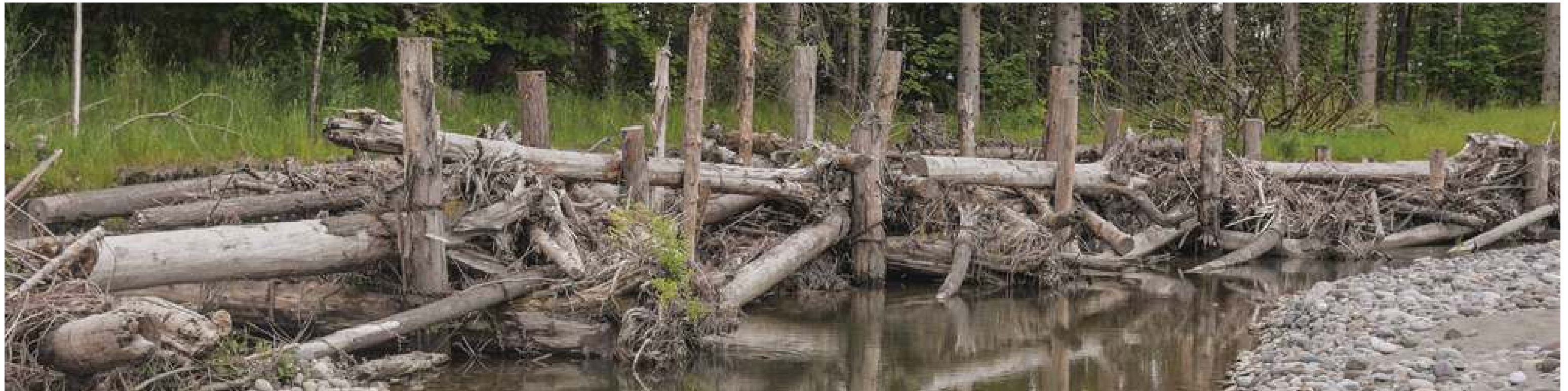
Log Toe-Wood Stream Restoration Project