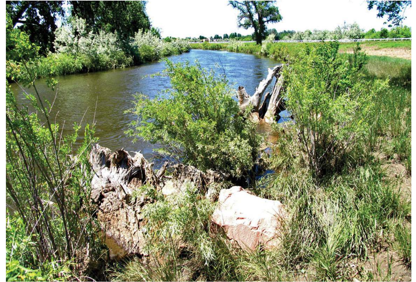
Log Toe-Wood Stream Restoration Years after Install