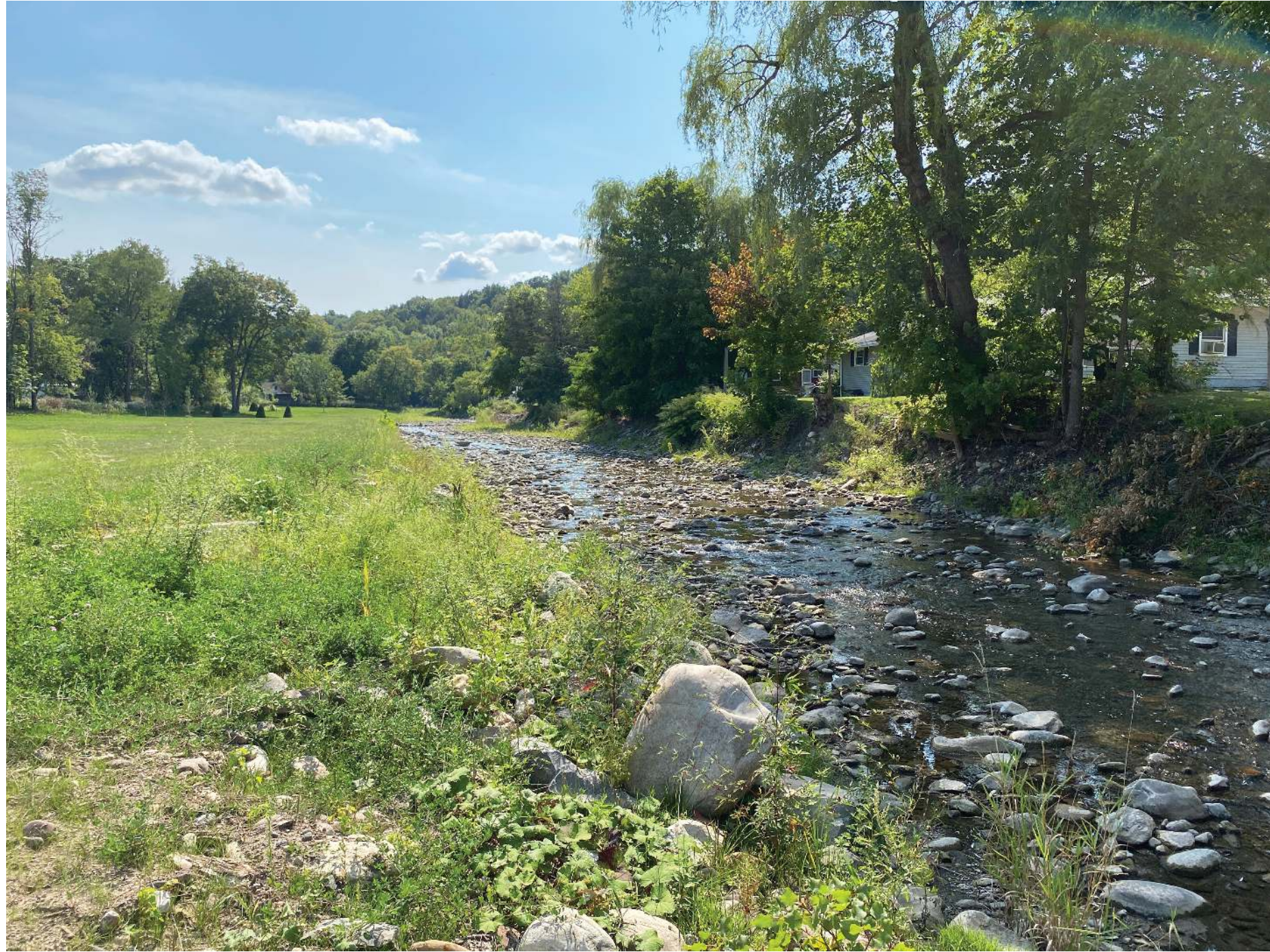
Fulmer Creek Stream Restoration Project Mohawk Valley