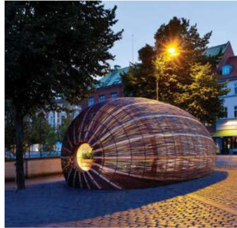
Willow and Recycled Material Pavilion