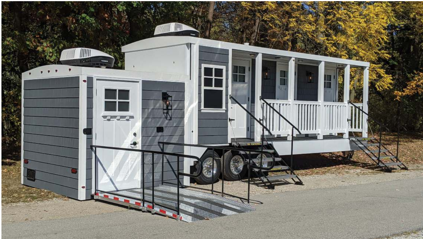
Ameri-can Potable Toilets