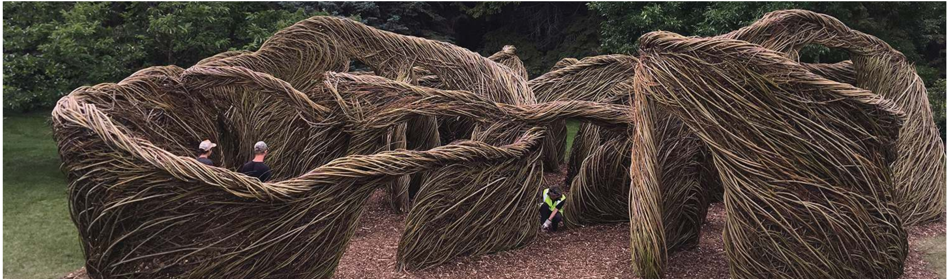
Waddled Willow Structure