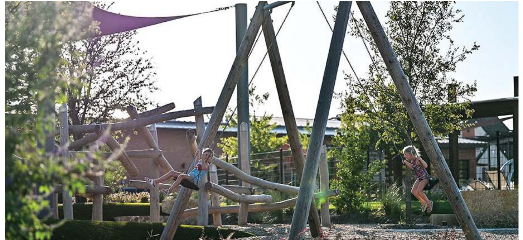
Log Playground Structures