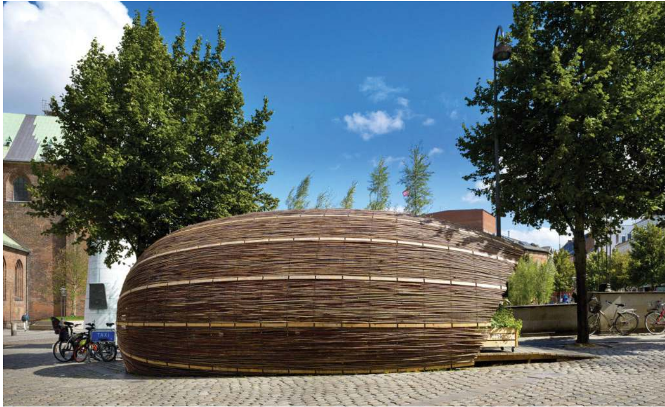
Willow and Recycled Material Pavilion