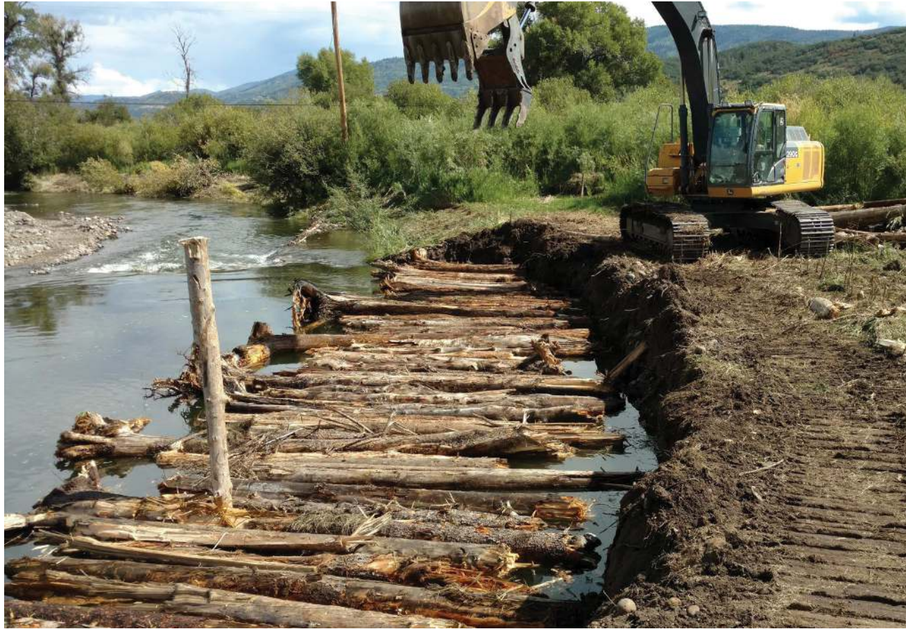
Log Toe-Wood Stream Restoration Install